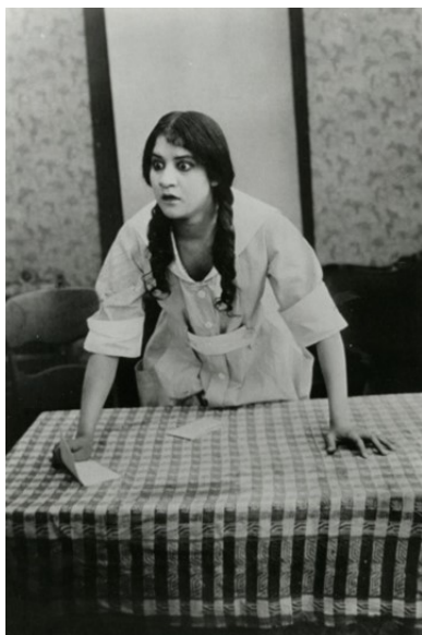
The New York Public Library

16. Write a story based on one of two photos (100–200 words, articles and contractions are counted as one word each).