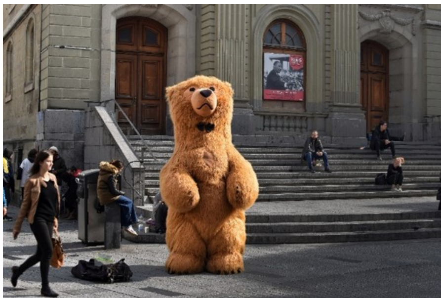
by Matteo Maretto @mattttttma