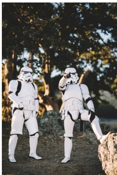
by Saksham Gangwar @saksham

16. Write a story based on one of two photos (100–250 words, articles and contractions are counted as one word each).