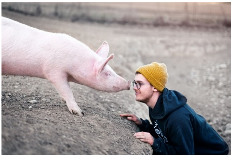
by Benjamin Wedemeyer