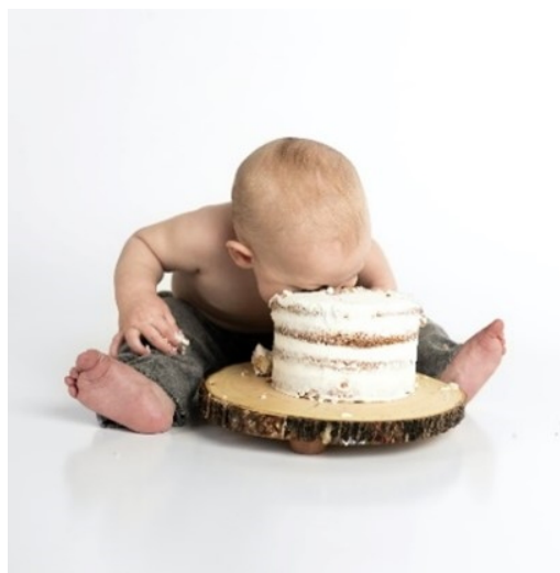
by Henley Design Studio