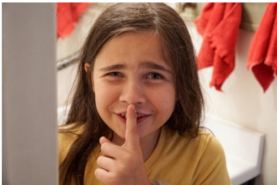
by Izzy Park @blue_jean