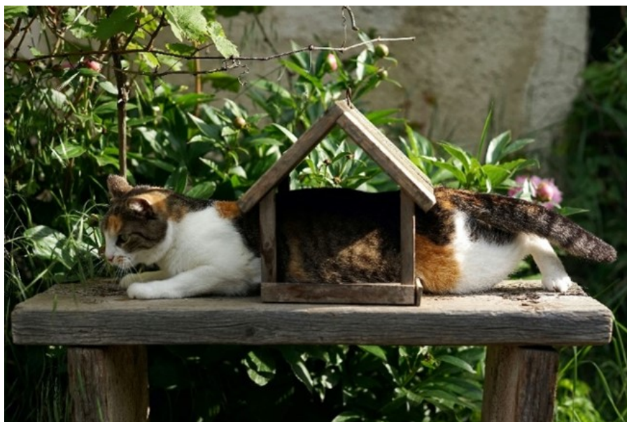
by Tomas Tuma @tomastuma