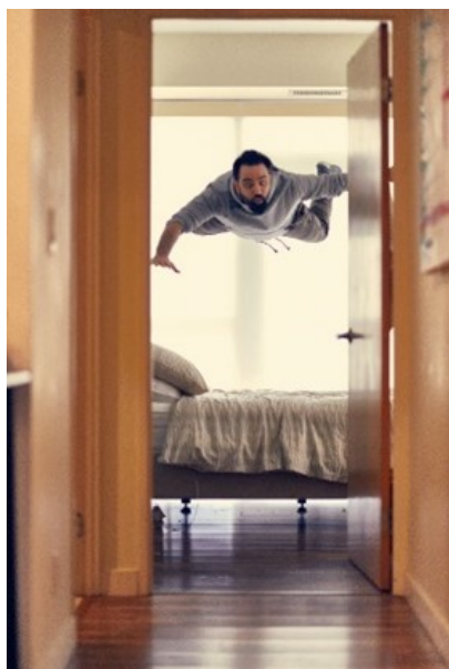
by Darius Bashar

16. Write a story based on one of two photos (100–250 words, articles and contractions are counted as one word each).