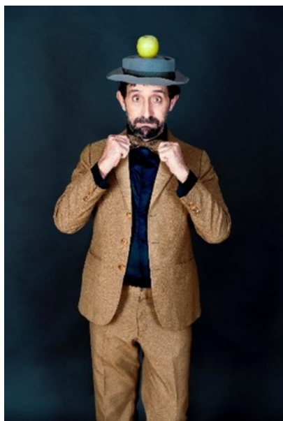
by Christian Buehner

16. Write a story based on one of two photos (100–250 words, articles and contractions are counted as one word each).