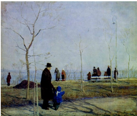
Upon the Dnieper River T. Yablonska

12. Compare two pictures (50–150 words, articles and contractions are counted as one word each).